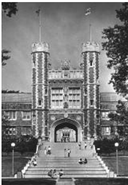
Washington University in St. Louis