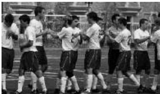
Twelve 2008 Washington University soccer team members attended the Residential Camp before choosing to apply to the university.

(314) 821-KICK (5425) or (314) 935-5174 email: joc@athletics.wustl.edu